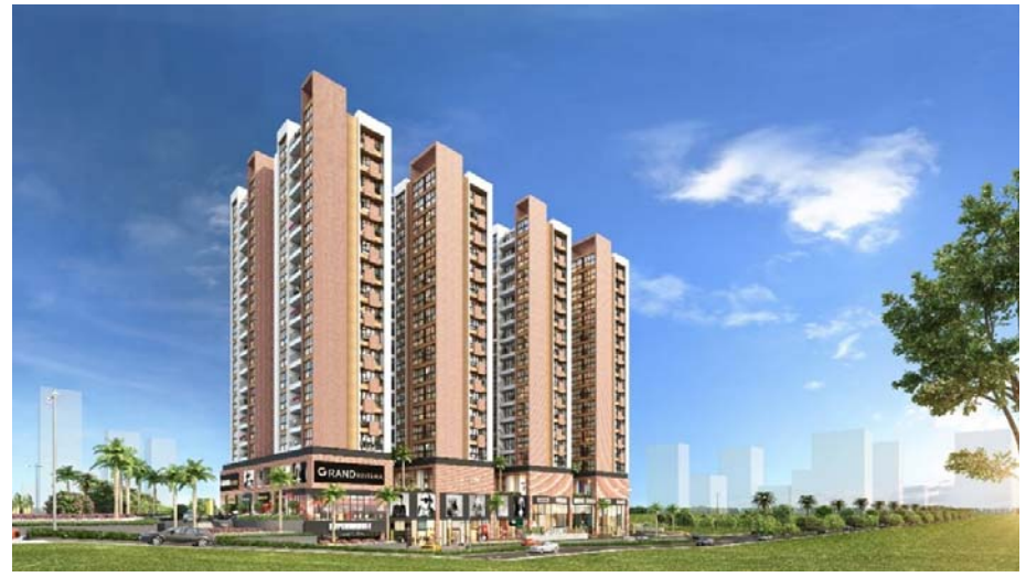
Retail + Residential Development, Cuttack