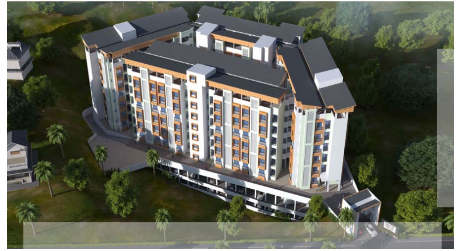
Habitat One Fifty-four, Mangalore