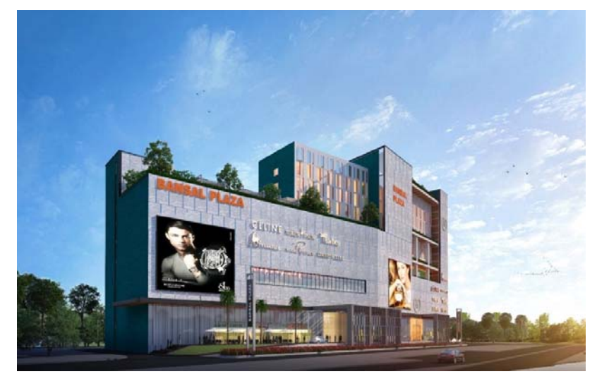
Commercial Building 1, Habibganj Station, Bhopal