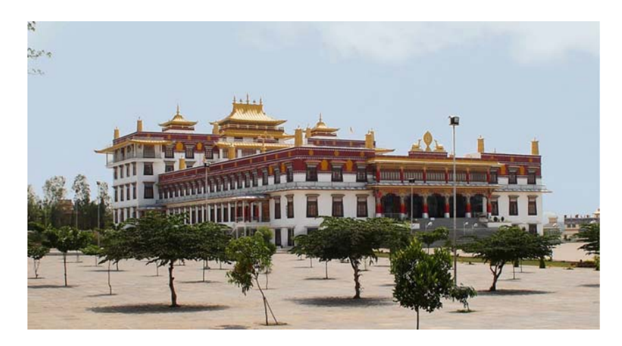
Buddhist Monestary at Mundgod (Hubali), Karnataka