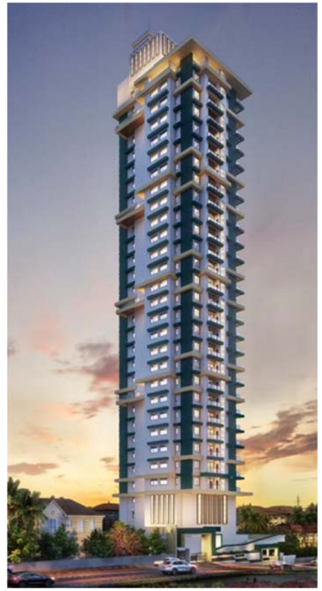
Citadel at Mangalore