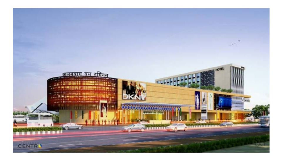
Winner of YII 2018 International award at London in field of Structural Engineering Bus Terminal and Mall building at Alambagh, Lucknow