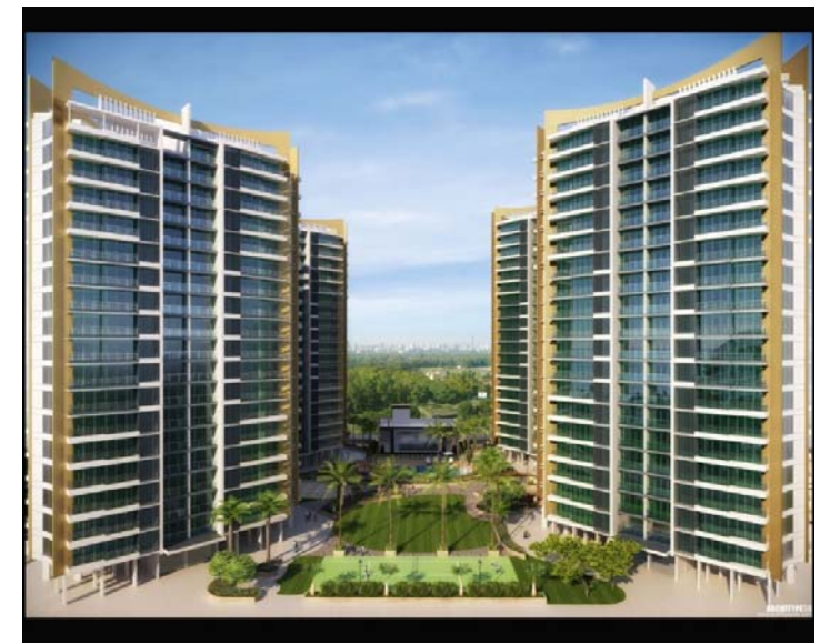
Spring Grove, Lokhandwala, Kandivali, Mumbai