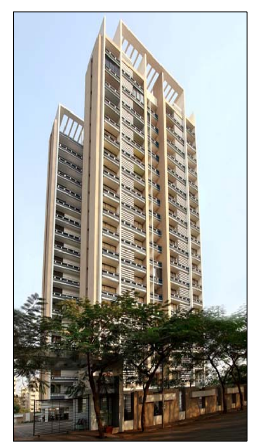
Living Essence, Mumbai