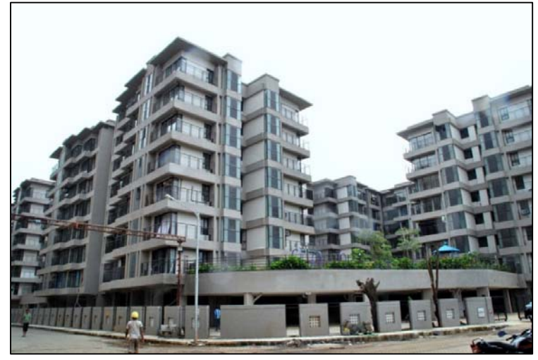
Kohinoor Residential Complex, Kurla, Mumbai