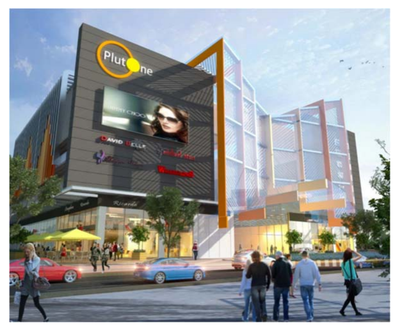
Plutone Plaza Mall, Rourkela